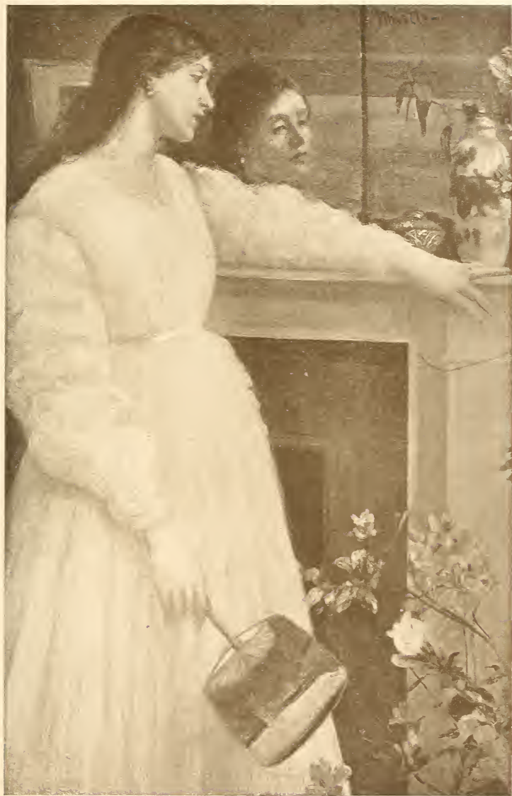
Symphony in White, No. 2. THE LITTLE WHITE GIRL.